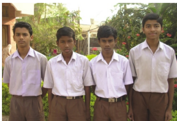
Attending Regional Mathematics Olympiad Camp -2006.

Rtapalli students are regularly selected to Orissa Regional Mathematics Olympiad Camps.