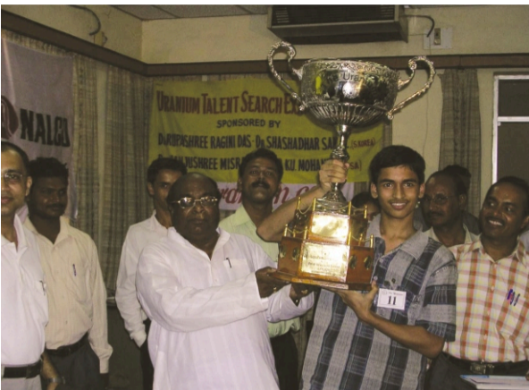
Some of our staff members