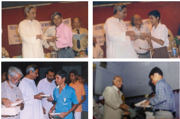
Rtapalli students receiving various awards in science and mathematics.