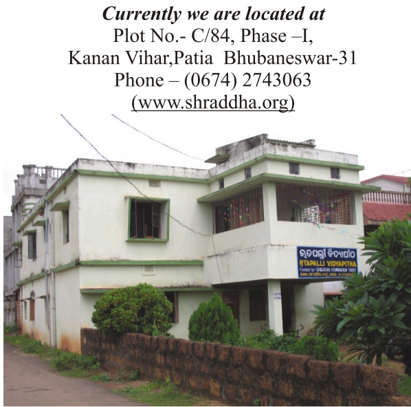
Soon we will move to our permanent place below near Bhubaneswar..